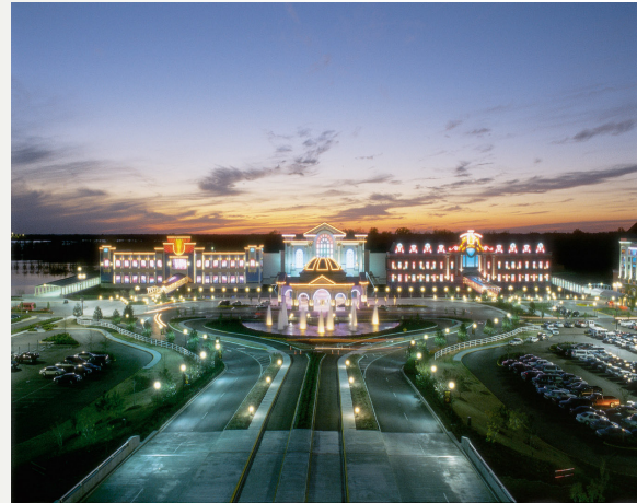
Tunica Convention and Visitors Bureau (TCVB), www.tunicamiss.com

Following the Monday afternoon sessions, attendees can travel to Tunica, MS to experience fun, food, and entertainment. The $30 fee includes roundtrip transportation to and from the Peabody and $10 in free slot play. The bus will board at 5:00pm at the Peabody Hotel and will depart Tunica at 10:00pm.